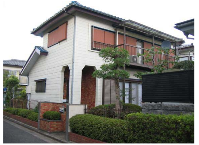
--Example of an off-base house in Mabori Kaigan

For an explanation about dealing with rental agents, up-front costs, and many other details, see websites below: